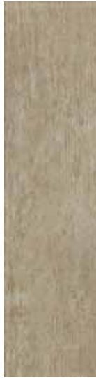
UHAJ Ash 6"x24" Rectified