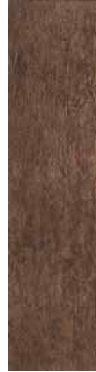
UJ3H Walnut 6"x24" Rectified