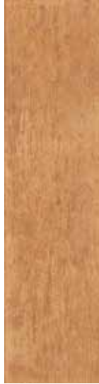
UHAM Oak 6"x24" Rectified