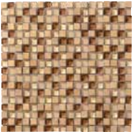
LG4B Caramel 12"x12"