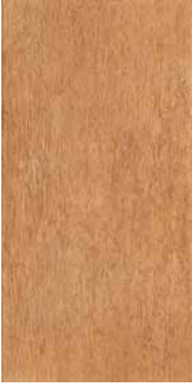
UJ3M Oak 12"x24" Rectified