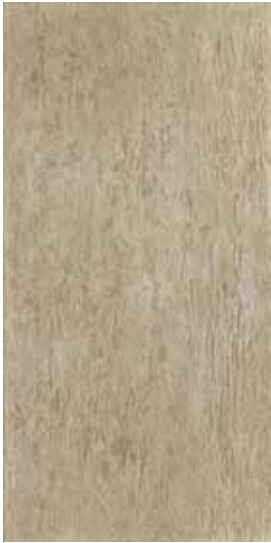
UJ3J Ash 12"x24" Rectified