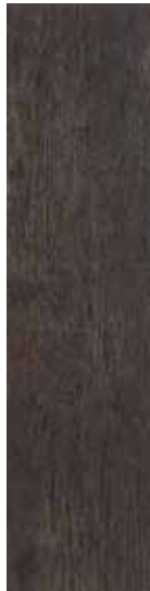
UHAL Ebony 6"x24" Rectified