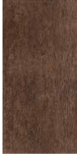
UJ3N Walnut 12"x24" Rectified