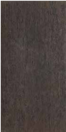
UJ3L Ebony 12"x24" Rectified