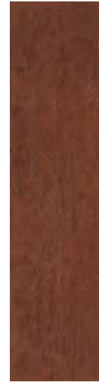
UHAK Cherry 6"x24" Rectified