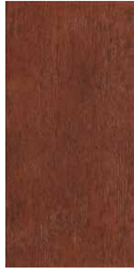
UJ3K Cherry 12"x24" Rectified