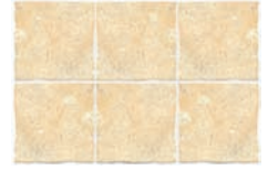
1648 Deep Gold