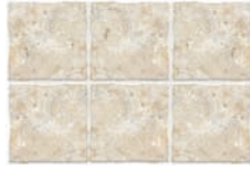
1604 True Beige