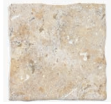
5604P True Beige