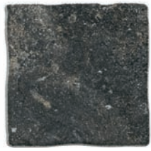
5606P Black (12x12 only)