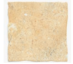
5648P Deep Gold (12x12 only)